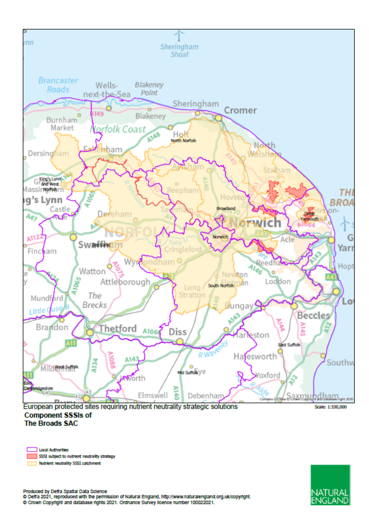
Figure 2. Map of the Broads SAC catchment area